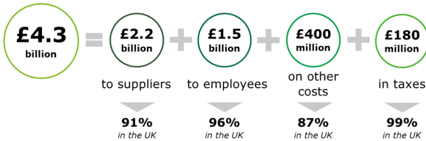
Figure 3 News media organisations expenditure