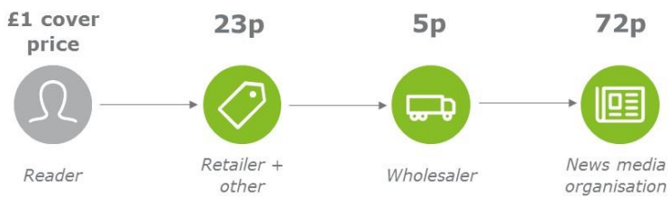
Figure 4 Distribution of the cover price